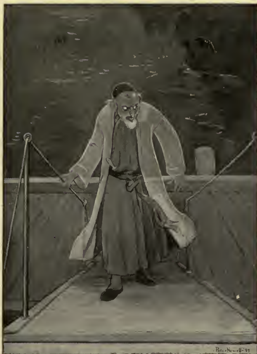
“ IN THE DEAD OF NIGHT SHYLOCK HAD STOLEN UP THE GANG-PLANK ”